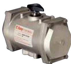
Stainless Steel Actuator