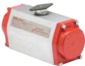
Extreme High Temperature Actuator