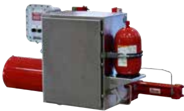
Custom Built Automation Packages

Rugged and repeatable performance under the most challenging conditions.