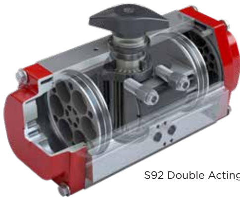
S92 Double Acting