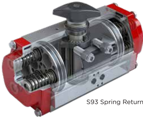
S93 Spring Return