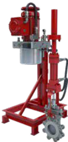
Custom Built Linear Actuators